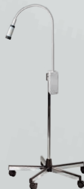
EL10 LED Examination Light on wheeled stand, metal base

For further information please refer to: www.heine.com