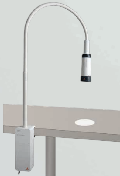
EL10 LED Examination Light with clamp mount

HEINE makes no compromises in manufacturing high quality medical instruments. Our commitment to vertical integration in manufacturing means we control all aspects of our instrument quality, from utilising carefully selected, well-matched materials to a high level of hand assembly. This ensures that each HEINE instrument meets or exceeds all requirements in any medical environment. We stand behind this commitment with a 5 year guarantee!