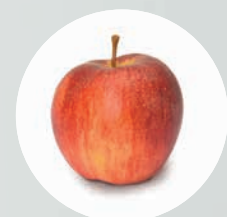
LED HQ : red is red