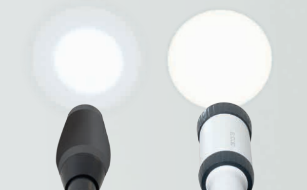
This is a conventional LED

The compact illumination head (Ø app. 60mm) allows an almost coaxial illumination, particularly in difficult application situations.